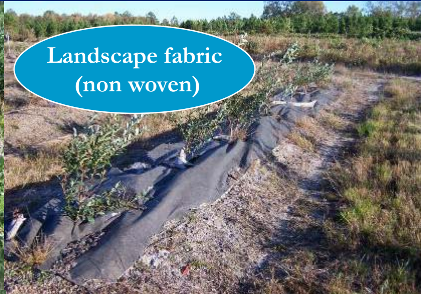
Landscape fabric (non woven)